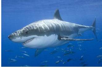
Great White Shark

All fish have a backbone and are cold-blooded (a fish's body temperature changes with the temperature of the water it's in.) Most fish have gills, fins, and scales.