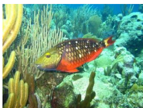
Stoplight Parrot Fish