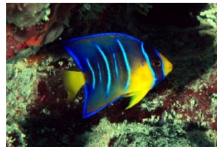
Queen Angel Fish