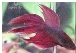
Siamese Fighting Fish